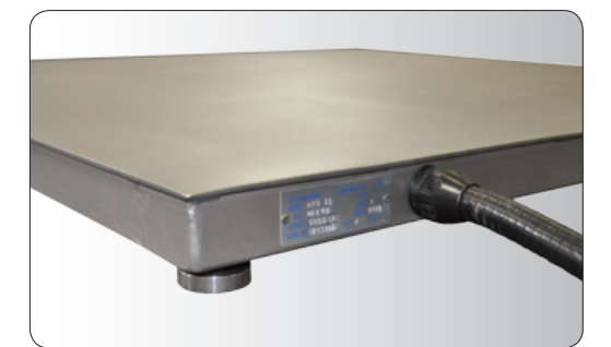
Washdown 🔺 - Ideal for hostile industrial applications

▲ Remote stainless steel j-box with 10' of seal tite conduit and 20' of indicator/load cell cable