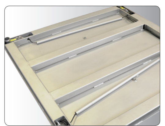
Tubular construction 🔺