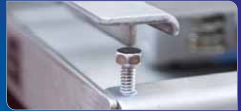
Heavy Duty Static Overload Stops Ten Times Capacity Overload Protection