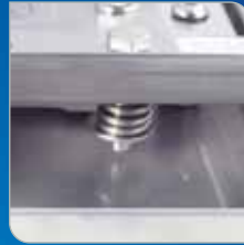
"Quad Spring" Shock Absorbing Design