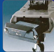
Easy to install Rechargeable Battery