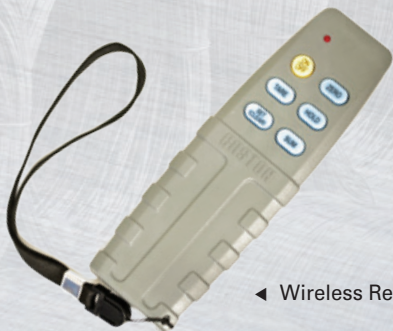
◀ Wireless Remote Control