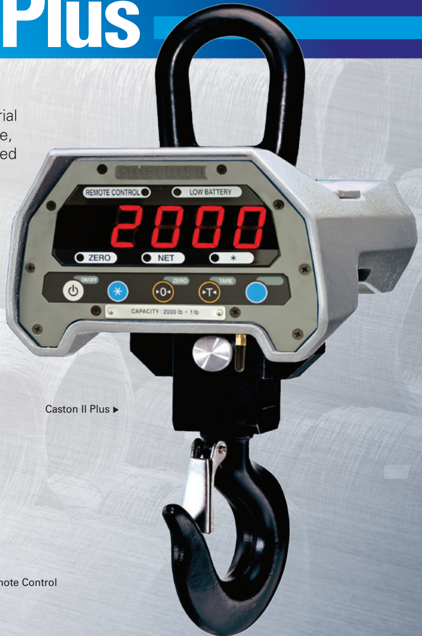
Caston II Plus ▶