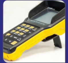
TWN Handheld Portable Indicator