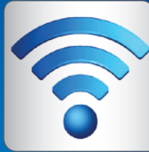
Optional Bluetooth Communication