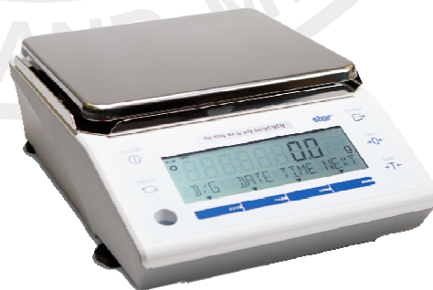
MG-S1501,R thru MG-S15000,R