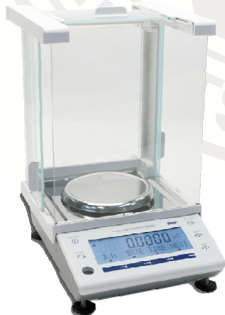
MG-S222,R thru MG-S1202,R