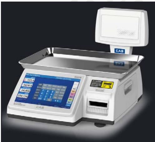
Fish Tray with CL7200-U (CL7200-P)