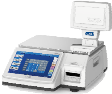
CL7200-U (Alternative name: CL7200-P)