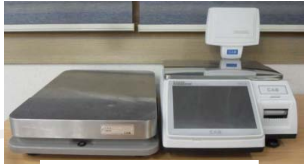
CL7200-UH (Alternative name: CL7200-PH)